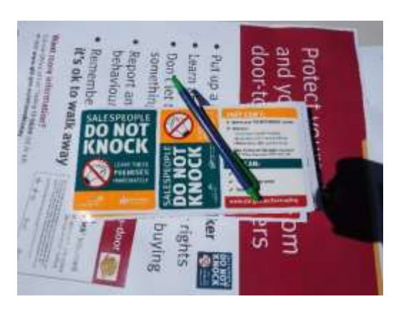
'Do Not Knock' stickers distributed on the day

Yarrabah is a large and geographically disparate community (about 2,500 people over an area of 158.8 square kilometres) so it is difficult to gauge what proportion of the community attended the barbecue over the course of four or five hours. Suffice to say, 360 sausages, 90 eggs, 10 kg of onions, 60 minute steaks and 30 loaves of bread were consumed.