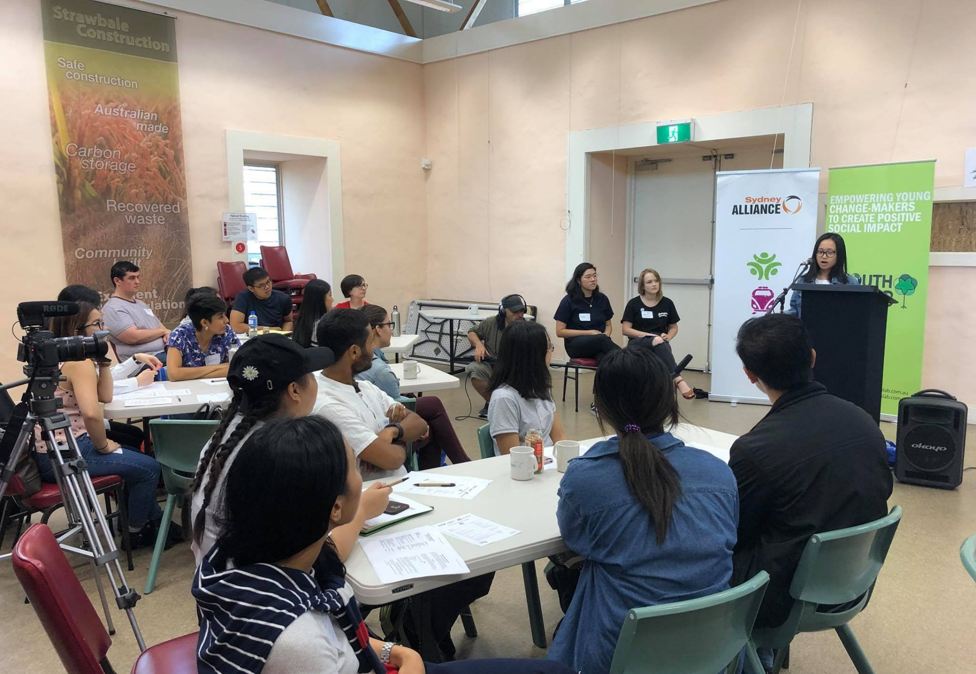
LISTENING: VOICES FOR POWER COMMUNITY TABLE TALKS