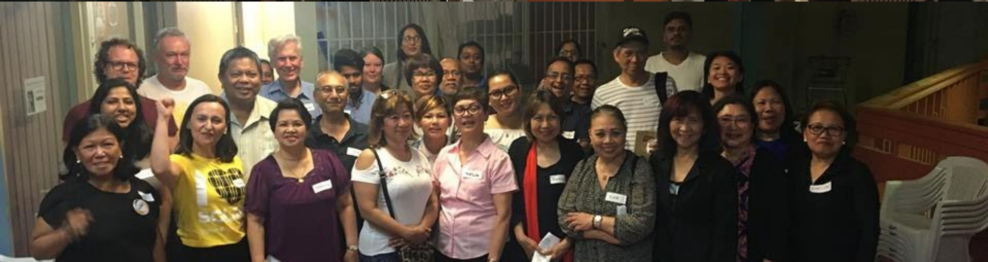
LISTENING: VOICES FOR POWER COMMUNITY TABLE TALKS