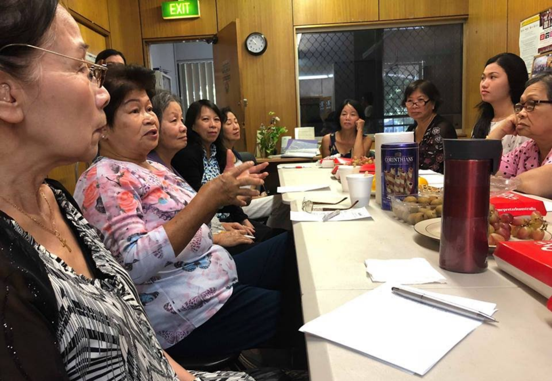
LISTENING: VOICES FOR POWER COMMUNITY TABLE TALKS