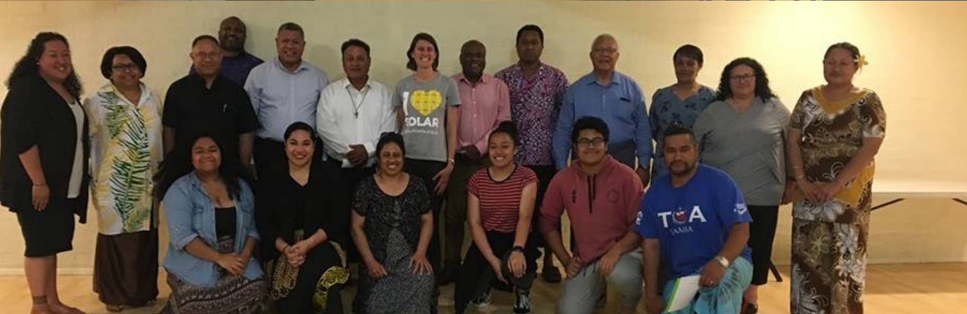
LISTENING: VOICES FOR POWER COMMUNITY TABLE TALKS