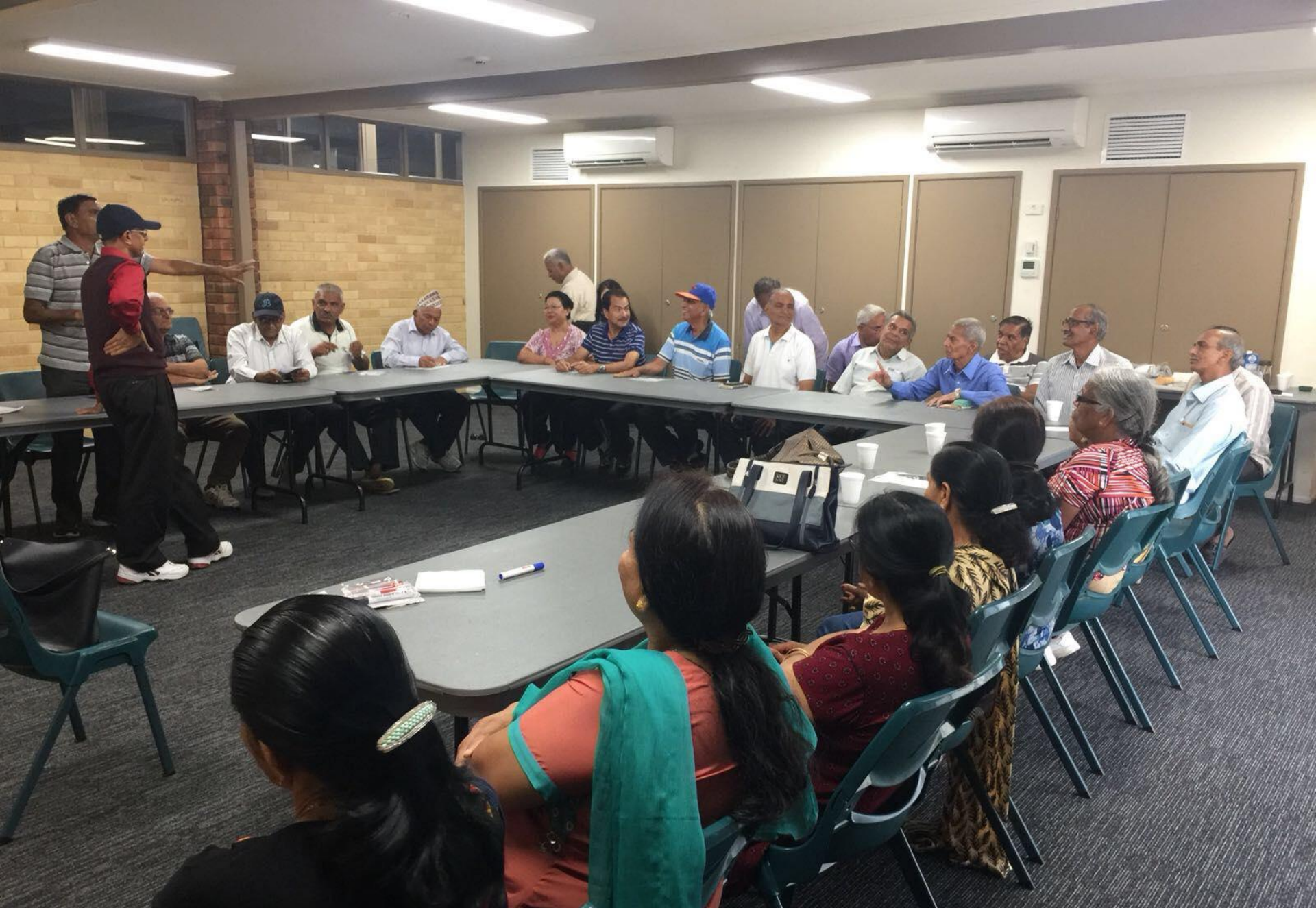
2018 - LISTENING: VOICES FOR POWER COMMUNITY TABLE TALKS