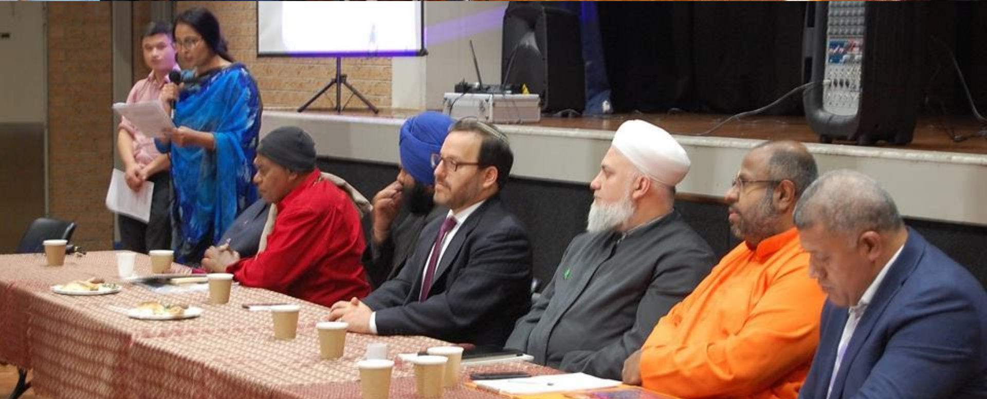
LISTENING: VOICES FOR POWER INTERFAITH TABLE TALK